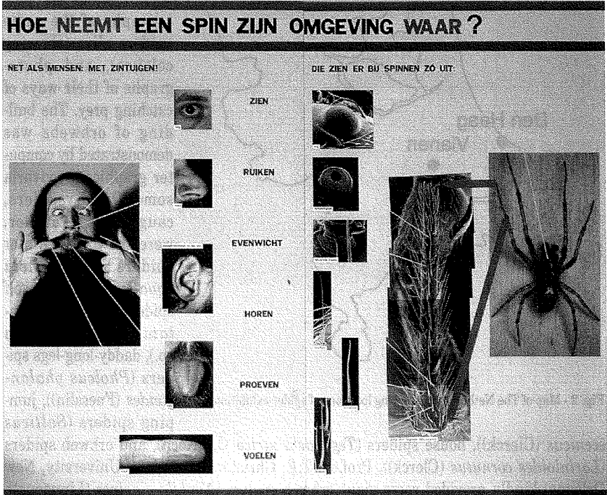
Fig. 3 - Example of an information panel, showing sense organs of spiders compared with sense organs of man.

Vianen have not been counted. Reactions of visitors could only quantitatively be derived from the remarks written down (mainly by children) in the visitor's book. No inquiry was held.