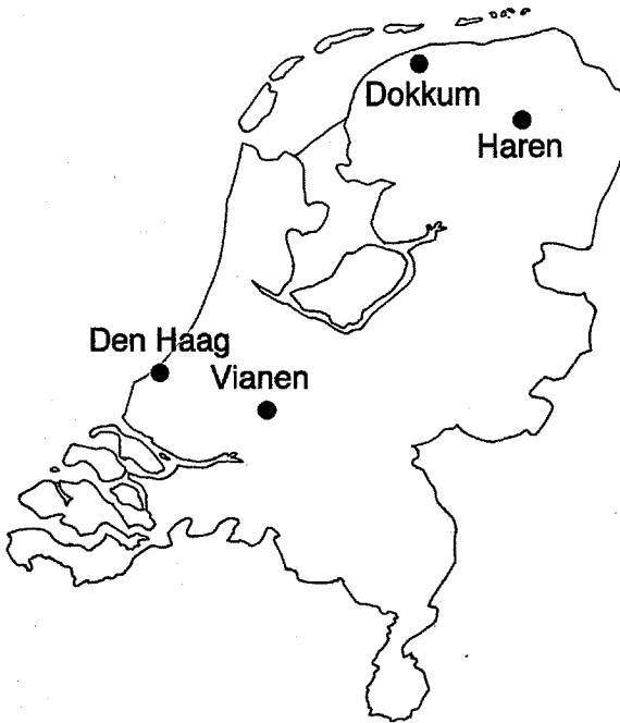
Fig. 2 - Map of The Netherlands, showing locations of spider exhibitions.

Prey capture was displayed in show-cases by preserved spiders (showing the size of the spiders), together with photographs of the same spiders alive (showing colours), and photographs of their ways of catching prey. The building of orbwebs was demonstrated by computer graphics. In vivaria some Dutch spiders, caught by the author, were shown, like water spiders ( Argyroneta aquatica (Clerck)), wolf spiders ( Pardosa amenata (Clerck), Pirata sp.), daddy-long-legs spiders ( Pholcus phalangoides (Fuesslin)), jumping spiders ( Salticus