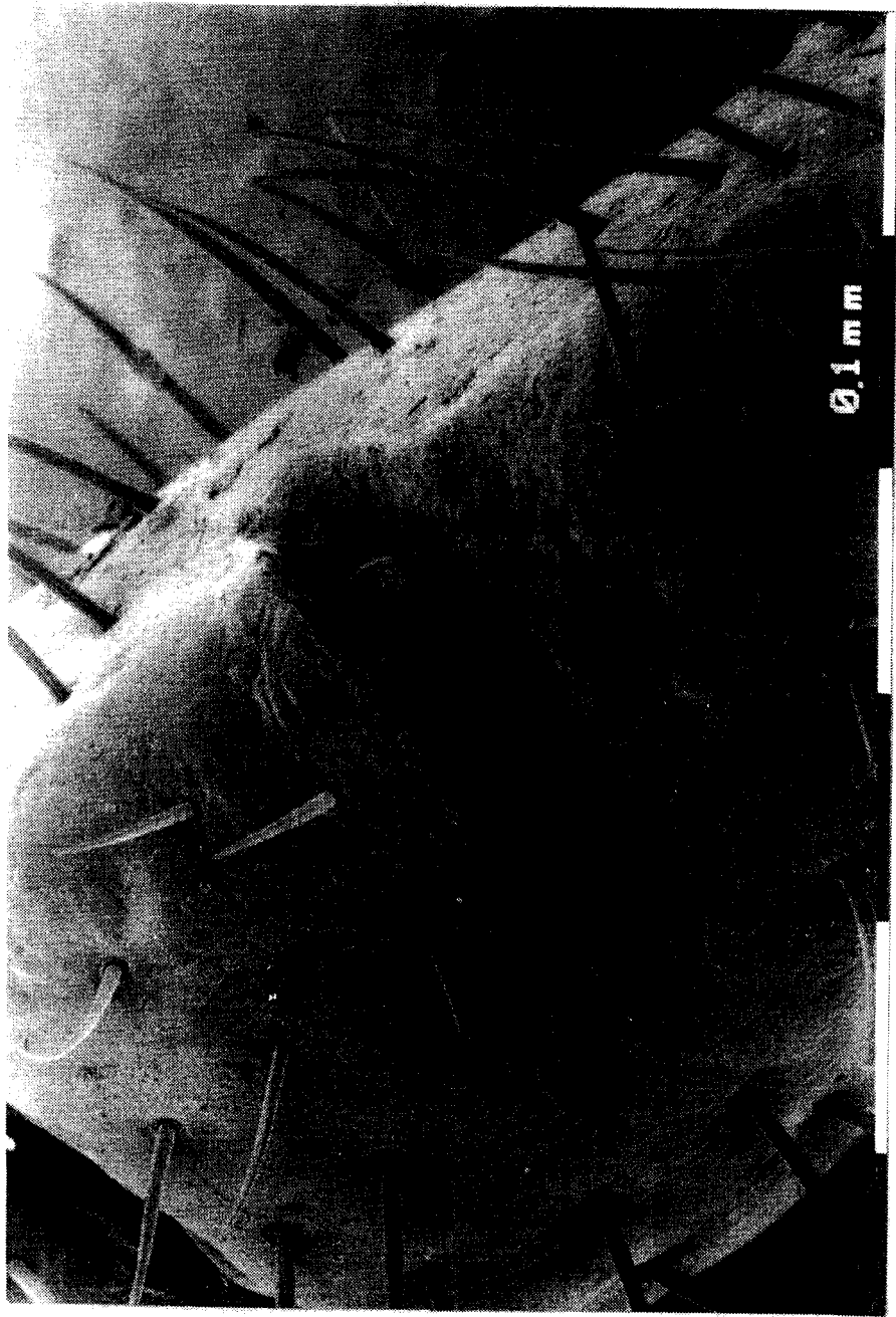
Fig. 2 Scanning electron microscopic view of a tarsal injury from the tactile leg of a Typopeltis crucifer female.