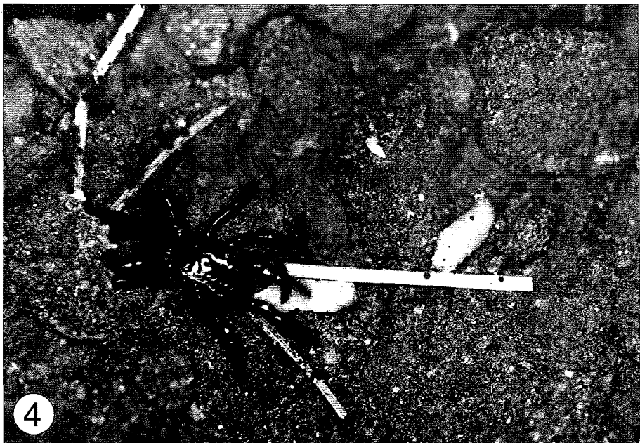
Figs 2-4. 2 - closed trapdoor of Latouchia swinhoei with attached grass-blades; 3 - trapdoor opened; 4 - Latouchia swinhoei catching prey at twig line from blades offered in the laboratory.