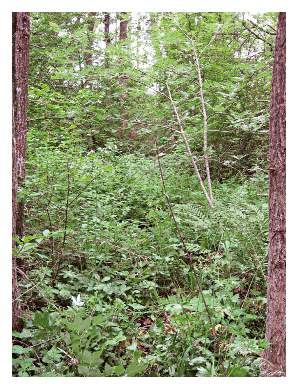
Fig. 2: Mixed dense grove (site 2).

The six most abundant spider species at each site are listed in Tab. 3. Among the ten most abundant species in the groves (sites 1 and 2), the following six were shared in common: Pardosa lugubris, Dicymbium nigrum, Ozyptila praticola, Pachygnatha listeri, Tenuiphantes tenebricola and Diplocephalus picinus. Three species, Pardosa lugubris, Pachygnatha degeeri and Trochosa terricola, were among the top-ten at all three more open sites (3-5: wooded pasture and wooded meadows). In addition, Haplodrassus silvestris, Tiso vagans and Trochosa spinipalpis were abundant at two sites, i.e. in wooded meadows (sites 4 and 5). Dealing with all five habitats, a Pardosa species was the most dominant at four sites (P. lugubris at three and P. pullata once), and Diplostyla concolor in the dense grove. Species with high numbers at many sites also