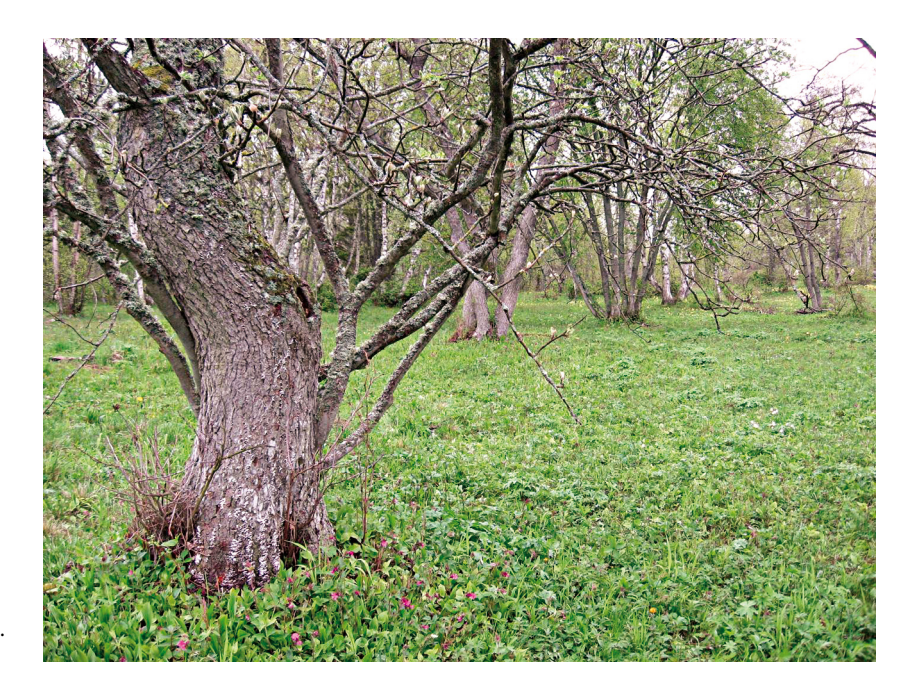
Fig. 3: Wooded meadow (site 5).

in the recent Finnish Red Data Book (Pajunen et al. 2010). Jungfruskär (where the species was found on both wooded meadows) represents its third locality in Finland. In addition, Micaria fulgens , found in wooded aspen pasture, is listed as NT (nearly threatened) in the Red Data Book.