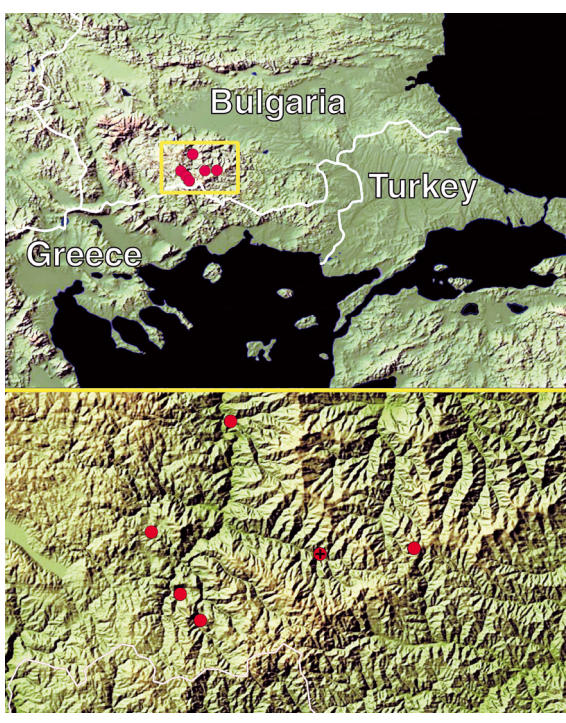
Fig. 20: Map showing type locality (+) and known distribution of Euscorpius drenskii sp. n.

Diagnosis. A medium-small Euscorpius species, total length 28–31 mm. Colour of adults light to medium brown/reddish, carapace darker. Reticulation or marbling varies from absent to highly marked on chelicerae, carapace, mesosoma and metasoma. The number of