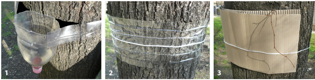
Fig. 1: Pitfall trap made from a plastic bottle